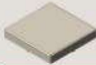
EZ-Shield Guardian Surface-Mount One piece surface-mount with alignment pins.

These are Orbel's standard shield families, which outline construction styles that easily lend themselves to modified shield sizes: