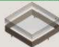
Snap-Shield Groove-Loc A two-piece shield design that utilizes a continuous groove feature in the shield cover.