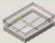
Snap-Shield Bullzeye Two piece surface-mount shield with castellated edges.